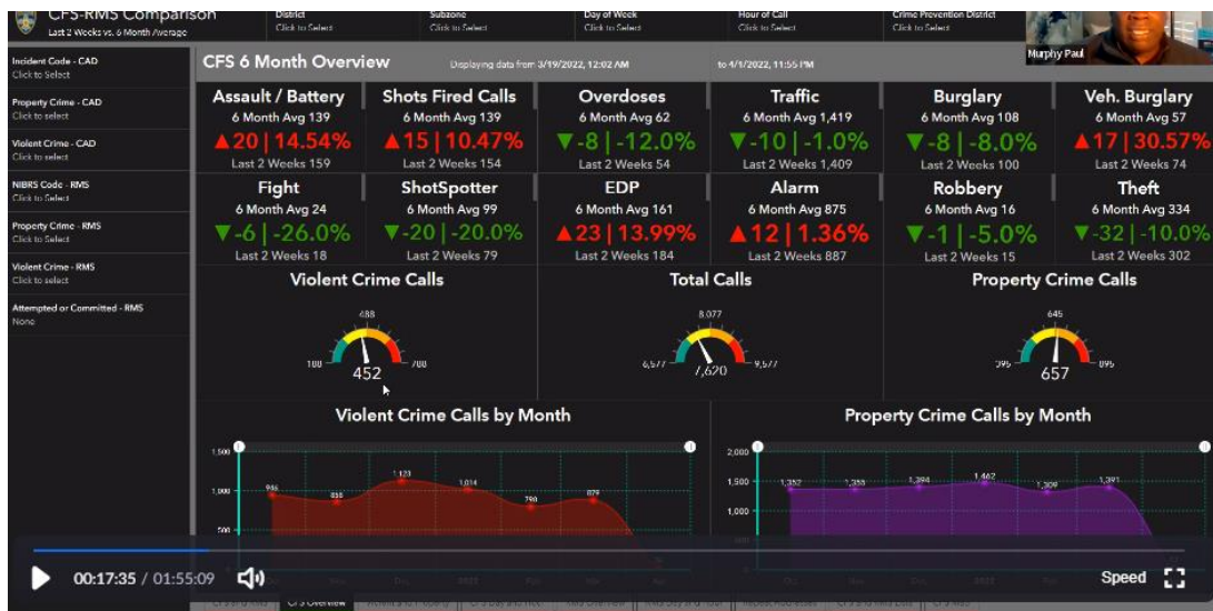
Exhibit C - Sample of EBR Police Crime Dashboard

Discussion Real Time Crime provides dashboards used to assist in real time patrol decisions & monitoring crime statistics. Provides focus on micro areas that need attention. Allow capability to review crime results.